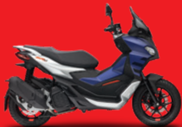
|| INFINITY BLUE