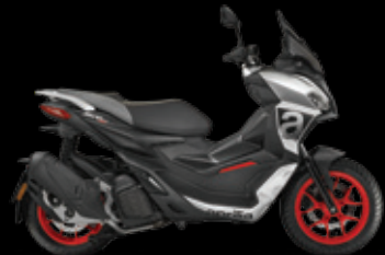
|| IRIDIUM GREY