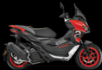
|| RACEWAY RED