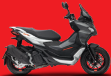
|| STREET GREY