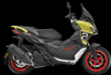
|| STREET GOLD