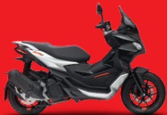
|| APRILIA BLACK